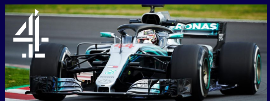
F1: The Austrian Grand Prix - Weekend