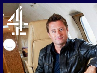
George Clarke's Amazing Spaces Wednesday 9pm