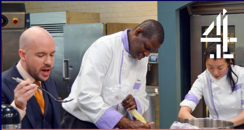
Bake Off: The Professionals Tuesday 8pm