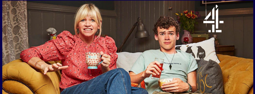
Celebrity Gogglebox – Friday 9pm