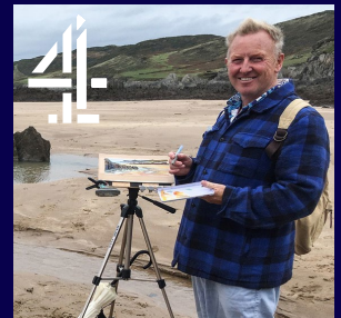
Devon & Cornwall – Monday 8pm