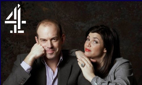
Location Location Location Wednesday 8pm