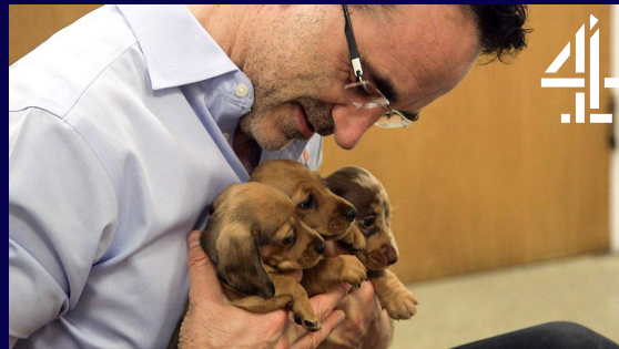
The Supervet - Thursday 8pm