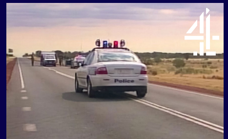
Murder In the Outback – Sun-Weds 9pm

- Series ended last Friday with an overnight audience of 1.68 million viewers – up 16% versus the week prior - The series averaged 1.61 million viewers overnight, up 22% on all episodes in 2019