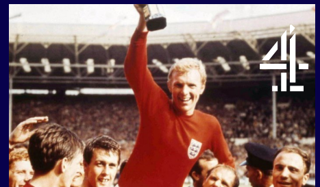
1966 World Cup Final Sunday Afternoon

- The latest episode earlier this week achieved an overnight audience of 2.01million viewers - Episodes 1-3 have averaged 2.14 million overnight viewers – up 46% versus last series