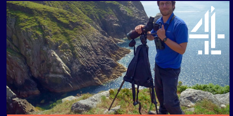
Devon & Cornwall – Monday 8pm

- A massive 4.48 million viewers tuned in to the launch episode last Friday – the biggest celebrity episode ever - The show was up 59% on last years launch episode and achieved an impressive 1634 share of 46.4%