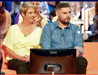
Britain's Best Parent – Thursday 8pm

- This new series launched with an incredible overnight audience of 2.19 million viewers – up 112% versus the slot average