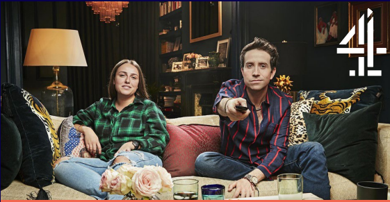
Celebrity Gogglebox – Friday 9pm

- A massive 4.48 million viewers tuned in to the launch episode last Friday – the biggest celebrity episode ever - The show was up 59% on last years launch episode and achieved an impressive 1634 share of 46.4%