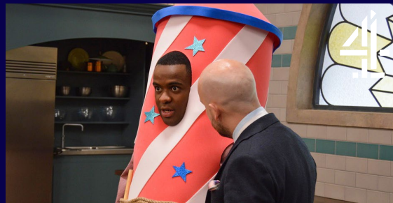
Bake Off: The Professionals - Tuesday 8pm

- Episode 2 of the show grew 2% week on week, delivering an overnight audience of 724k viewers