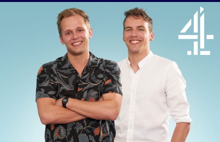
First Dates Hotel – Thursday 9pm

- This one-off replay of England's world cup triumph pulled in a peak of 1.3 million viewers, with an average audience up 123% versus the slot average