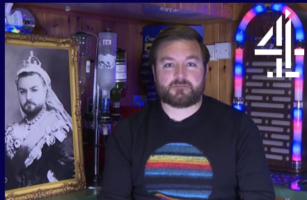
Last Leg: Locked Down Under – Fri 10pm

- Fred and the team delivered an uplift of 11% in their overnight audience last week, with 1.47 million tuning in