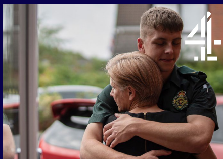
Paramedics: Britain's Lifesavers Monday 9pm

- Episode 6 delivered another strong audience of 1.75 million viewers, up a massive 56% versus the slot average – and episodes 1-5 have now consolidated at 2.1 million viewers.