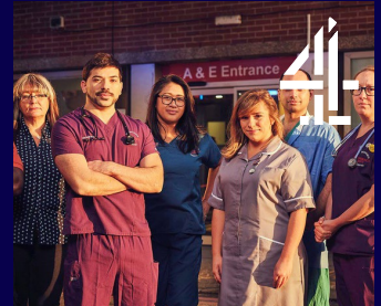
24 Hours in A&E Tuesday 9pm

- This new series pulled in a strong 1.56 million viewers, up 27% on slot average.