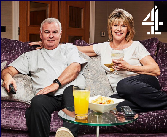
Celebrity Gogglebox – Friday 9pm

- Episode 6 last Friday delivered an overnight audience of 3.54 million viewers – for the sixth week running the show delivered the biggest volume of 1634s across any channel in the whole week!