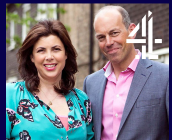
Location Location Location Wednesday 8pm

- A repeat of this special for Stand Up To Cancer pulled in a respectable 1.06 million viewers, with a 20% share of 1634sviewers – up 34% versus the prior series.