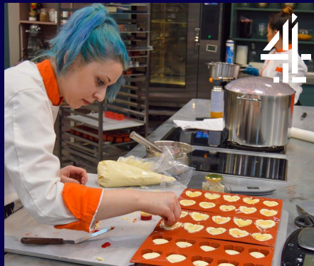
Bake Off: The Professionals Tuesday 8pm

- 1634 Viewing to the series is up 57% in volume versus the prior series – and the 1634 share has grown an incredible 117%!