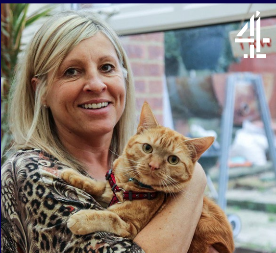
Supervet – Thursday 8pm

- Week 5 delivered an overnight audience of 1.78 million viewers earlier this week – up 4% versus the prior week and securing an 18% share of 1634 year olds.