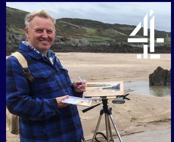
Devon & Cornwall Monday 8pm

- Episodes 1-7 have now consolidated at a very impressive 2.73 million viewers – up 34% versus the prior series.