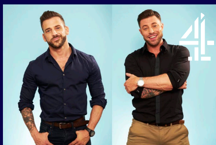
Celebrity First Dates – Friday 10pm

- Week two of this series of specials pulled in 1.36 million viewers – up 22% versus the slot average.