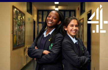
School that tried to end Racism Thursday 9pm

- Episode 3 of the current series pulled in 1.33 million overnight viewers, up 15% on last week and up 19% versus the slot average