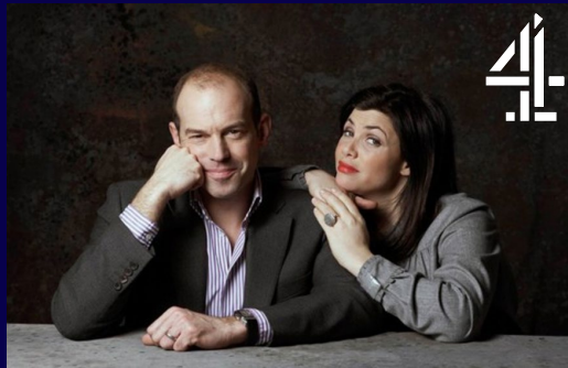
Location Location Location Wednesday 8pm

- Week 3 hit a series high attracting 1.99 million overnight viewers, up 9% week-on-week, and the series biggest overnight since 2018