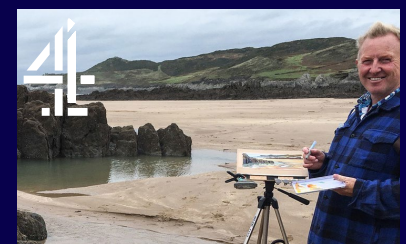
Devon & Cornwall Monday 8pm

- Last Thursday saw this fascinating new series launch with an average of 959k viewers, winning an 11% share of young audiences