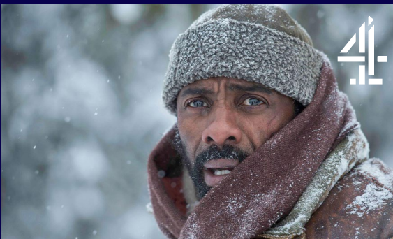
The Mountain Between Us – Sunday 9pm

- Week four was up 43% week on week, delivering an incredible audience of 2.05 million viewers - a whopping 88% up on slot average