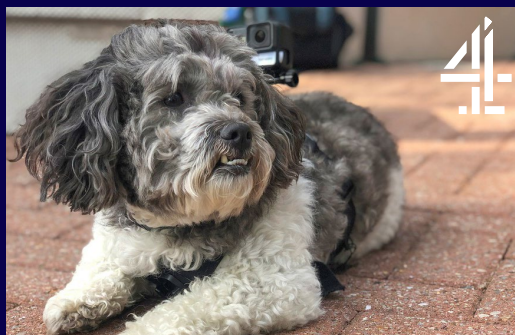
Celebrity Snoop Dogs - Friday 8.30pm

- This blockbuster attracted an overnight audience of 1.71 million viewers – up 96% on the slot average and the biggest overnight to a film on Channel 4 since New Years Day