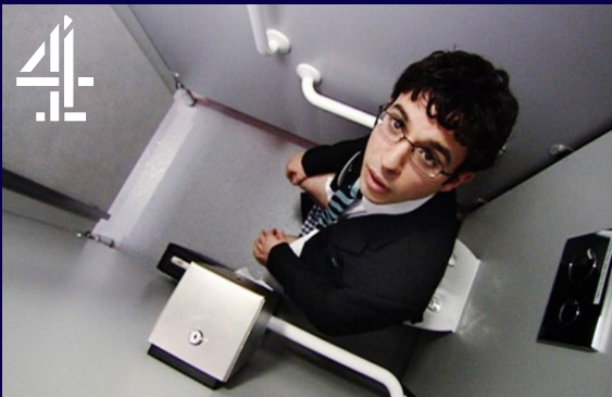
The Inbetweeners Box-Set – Friday Night

- This weeks episode was up 9% versus last week, drawing in 1.43 million viewers and an 11% ABC1 Share