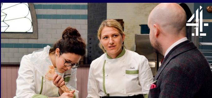
Bake Off: The Professionals - Tuesday 8pm