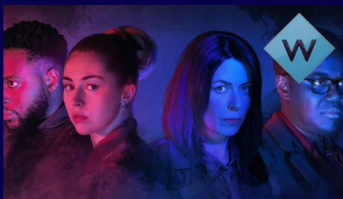
We Hunt Together – Wednesday 10pm

BT Sport's live coverage of the Bundesliga clash between Bayern Munich and Borussia Dortmund was watched by 298k viewers, BT Sport's 2nd biggest audience ever to a German League match