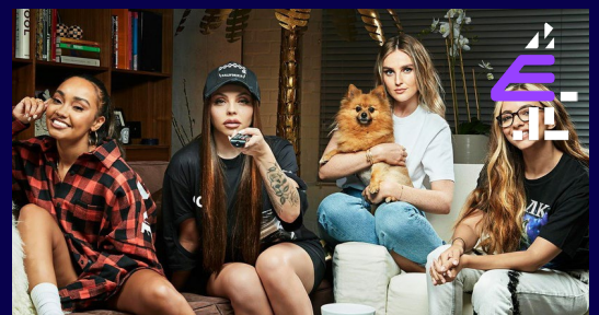
Celebrity Gogglebox – Wednesday 9pm

Last week, the show delivered its biggest audience of the year with the Channel's 6th biggest overnight of the year