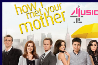
How I Met Your Mother Wednesday 8.30pm

This new 6 part drama launched last Wed with 121k viewers - is double the Channel's slot average