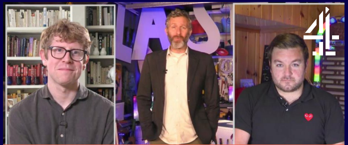
The Last Leg: Locked Down Under - Friday 10pm