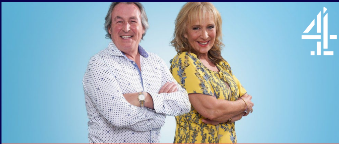
First Dates Hotel – Thursday 9pm