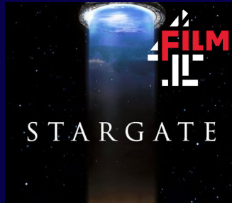
Stargate – Monday 9pm

The latest episode delivered an 11% share of 1634 year olds, up 131% vs the slot average