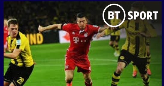
Live Bundesliga – Tuesday

Stargate was watched by over 670k viewers, up 114% vs the slot average and helping Film4 become the most watched Digital Channel between 9pm-11pm