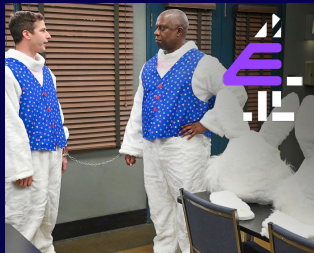
Brooklyn 99 Thursday 9pm

The latest episode delivered an 11% share of 1634 year olds, up 131% vs the slot average