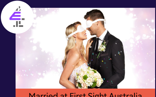
Married at First Sight Australia