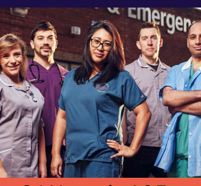
24 Hours in A&E -Wed 9pm

Week 4 was watched by 1.2 million, up 31% week-on-week. A 10.2% 1634 Share was up 43% on the slot average