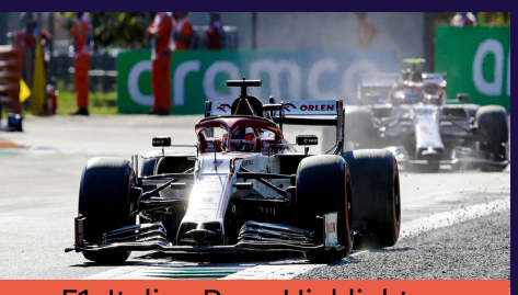
F1: Italian Race Highlights-Saturday 6.30 pm

Watched by just over 1 million last Saturday at 9pm. Up 25% on the slot average