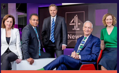
Channel 4 News Weekdays 7pm

Across the lockdown period year-onyear viewing among 1634 Adults to C4 News is up 68%