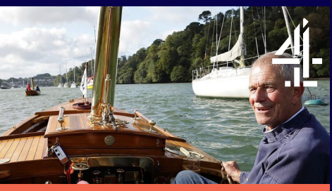
Devon & Cornwall – Monday 8pm