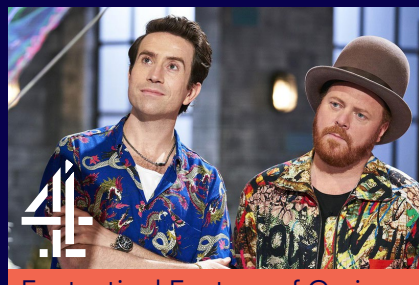
Fantastical Factory of Curious Craft - Sunday 7pm

- Episode 7 of this brilliant crafting show was up 15% week-on-week delivering 652k viewers and achieving a 9% 1634 share - up 41% versus slot average