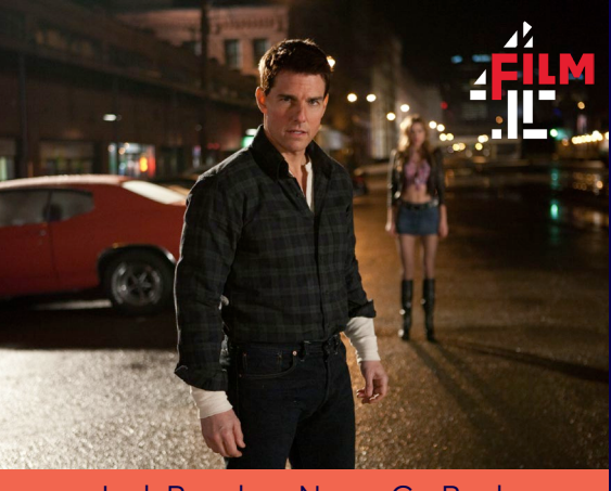
Jack Reacher: Never Go Back