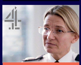
Crime & Punishment Thursday 9pm

- On Friday at 9pm Cats Does Countdown was up a 14% week-onweek with 999k viewers. A 20% 1634 Share won the slot across the Network.