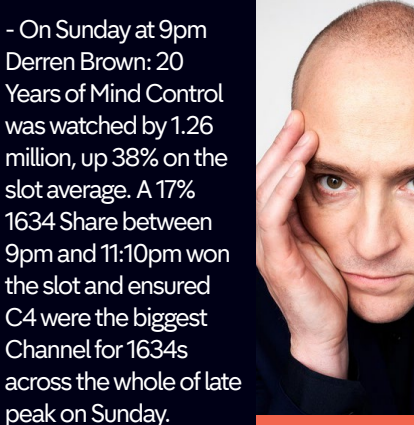
Derren Brown: 20 Years of Mind Control-Sunday 9pm

- Race Highlights on Sunday attracted an overnight audience of 1.57m. Individual viewing was Up 45% against slot average; ABC1 Viewing up 53%, 1634 Viewing up 17%, and Men up 74%.