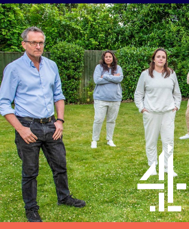
Lose A Stone in 21 Days with Michael Mosley Wednesday 10pm

- Episode 2 was watched by 1.57 million last Wednesday at 10pm. A 16% 1634 Share was up 130% on the slot average, beating all other Commercial Channels in the slot.