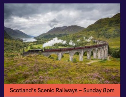
On Sunday at 8pm Scotland's Scenic Railways launched with 1.3 million viewers. Our highest rating show of the day and with a 9% ABC1 share it was up 23% on the slot average.

Week 2 attracted an overnight audience of 3.95 million. Its 45.6% 1634 share is the biggest ever delivered by a regular series. It won the 9pm slot by a huge margin for share and volume against all key demographics