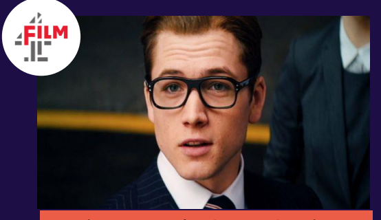
Kingsman: The Secret Service

Valerian and the City of a Thousand Planets was Film 4's biggest film of the week with 285k viewers on Tuesday at 9pm. A 3% Male share was up 17% on the slot average