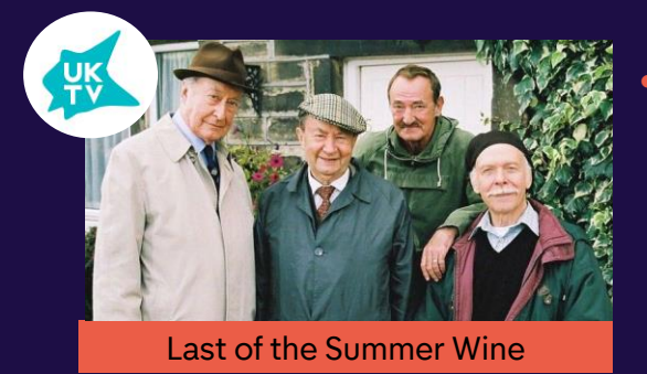
Across UKTV in the last 7 days the highest rating show was Last of the Summer Wine on Tues at 7:20pm with 455k

More4's highest rating show in the last 7 days was new series Emergency Rescue on Sunday at 9pm with 298k. A 3% 1634 Share was up 86% on the slot average