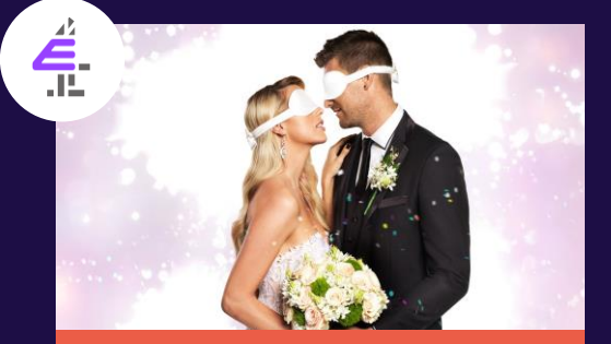
Married at First Sight Australia