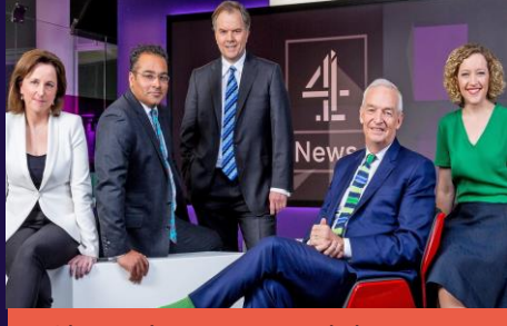
Channel 4 News Weekdays 7pm

Across the lockdown period year-onyear viewing among 1634 Adults to C4 News is up 64%