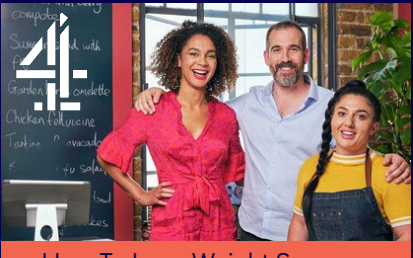
How To Lose Weight Summer Special – Tuesday 8pm

- On Tuesday at 8pm this oneoff Special was watched by 1.3 million. A 15.4% 1634 Share was enough to win the slot