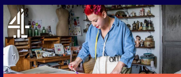
Escape to the Chateau: Make Do and Mend Thursday 8pm

- On Tuesday at 8pm this oneoff Special was watched by 1.3 million. A 15.4% 1634 Share was enough to win the slot